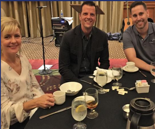
Guest speakers from Air Medicare were keynote speakers.